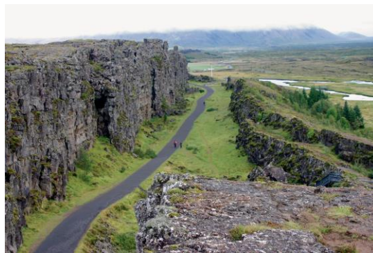
Thingvellir National Park

Travel onwards to Gullfoss, one of Iceland's most impressive waterfalls. Gullfoss is created by a glacial river, Hvita, that thunders over two ledges into a deep canyon. Several footpaths lead around the falls, each giving you a different view.