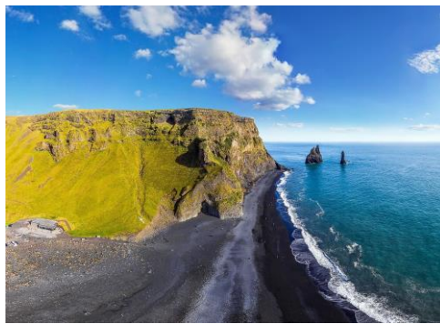
Reynisfjara black sand beach

Afterwards, you'll head to the magical black sands of Reynisfjara beach. You'll witness powerful waves and amazing basalt column structures carved by the power of the sea. Walking along the beach and hearing the thundering waves is a reminder of nature's power.