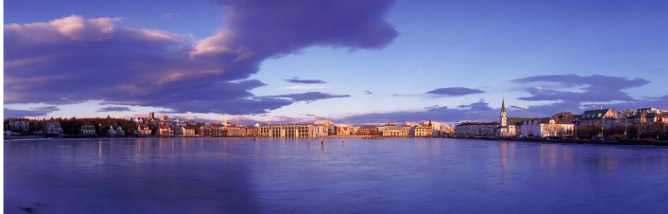
Tjörnin, the lake with view to downtown Reykjavik

Hotel Cabin (Standard room is 10m 2 ) or Hótel Klettur (upgrade version), Reykjavík. Dinner is on your own. (50km / 31mls)