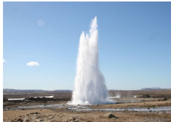
Geysir hot spring