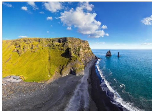
Reynisfjara black sand beach