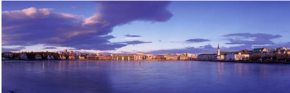
Tjörninn, the lake with view to downtown Reykjavik

Hotel Cabin (Standard room is 10m 2 ) or Hótel Klettur (upgrade version), Reykjavík. Dinner is on your own. (50km / 31mls)