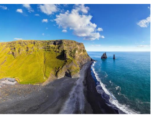
Reynisfjara black sand beach