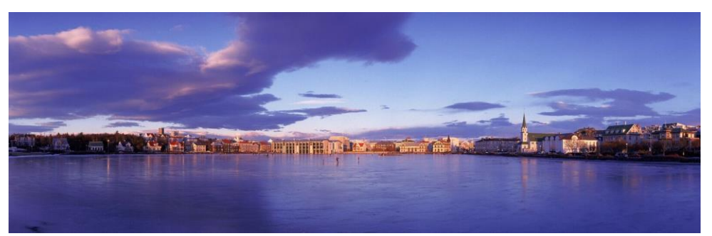
Tjörnin, the lake with view to downtown Reykjavik

Hotel Cabin (Standard room is 10m<sup>2</sup>) or Hótel Klettur (upgrade version), Reykjavík. Dinner is on your own. (50km / 31mls)