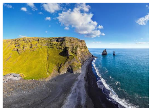
Reynisfjara black sand beach