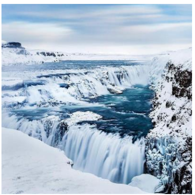
Gullfoss waterfall in winter