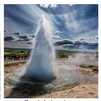
Geysir hot spring