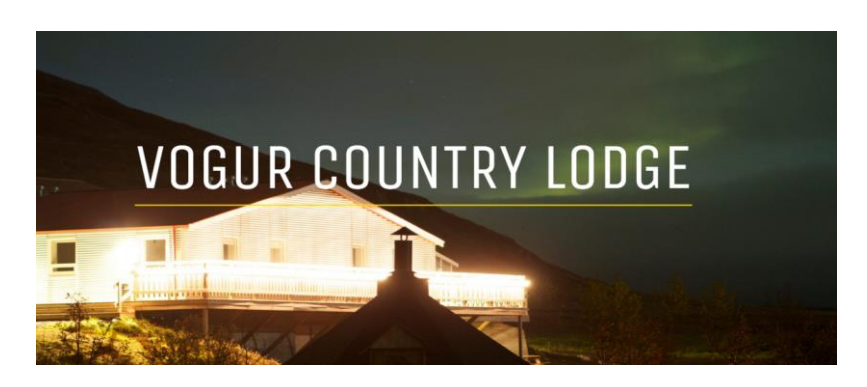
Day 4: Vogur Country Lodge – 2 nights special

Start your 3 day journey to the off the beaten track West of Iceland and the known highlights of Snæfellsnes and Borgarfjörður, and stay at Vogur Country Lodge. This small group tour ensures personal service and great experience, and of course a location with the best chances for the Northern Lights*.