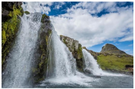
Kirkjufell Mountain and waterfall