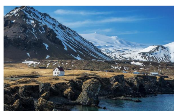
View to Snæfellsjökull glacier

Today iourney across landscapes on Snæfellsnes peninsula and experience stunning natural beauty and breathtaking imagery. We head to Stykksiholmur fishing village and further on the famous Kirkjufell Mountain and waterfall. The western part of the peninsula is the National Park, and we will the black pebble beach Djúpalónssandur, the Lonsdrangar rock pillars, Hellnar Cove and the beautiful coastline at Arnarstapi. We head then back to the hotel in Reykjavik.