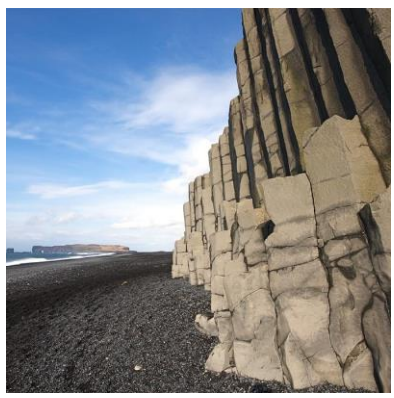
Reynisfjara black sand beach