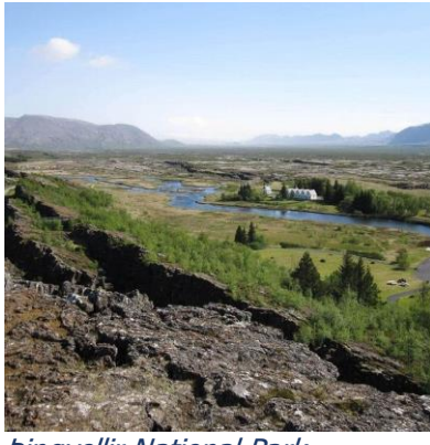
Þingvellir National Park