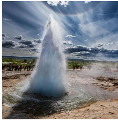
Geysir hot spring