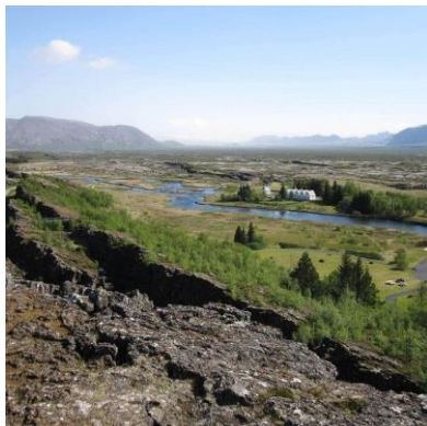
Bingvellir National Park