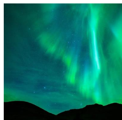
The Northern Lights