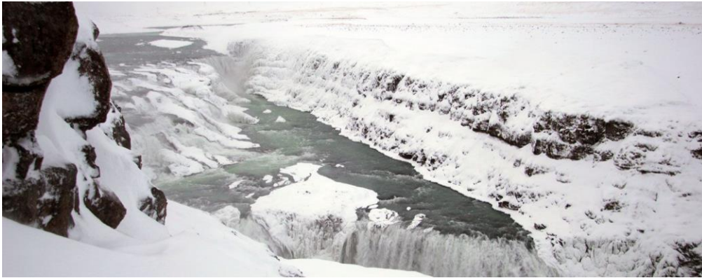
Gullfoss waterfall in winter

Icelandair Hotel Hamar, Borgarnes. Breakfast & light lunch included. Dinner is on your own. (300km / 186mls)