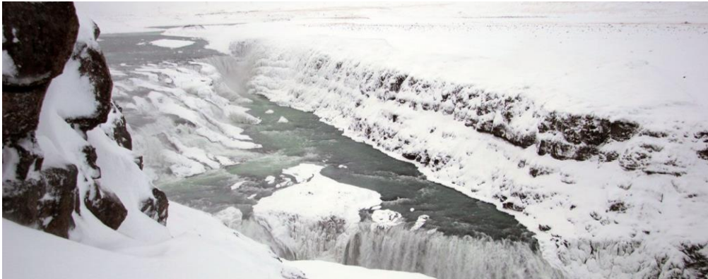
Gullfoss waterfall in winter

Icelandair Hotel Hamar, Borgarnes. Breakfast & light lunch included. Dinner is on your own. (250km / 155mls)