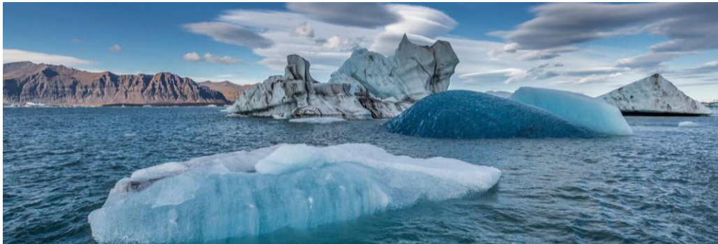
Floating icebergs on the Glacier lagoon

Hotel Klaustur, Kirkjubæjarklaustur. Breakfast included, dinner is on your own. (197km / 123mls)