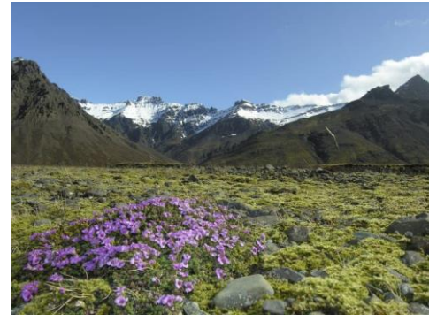
Vatnajökull National Park