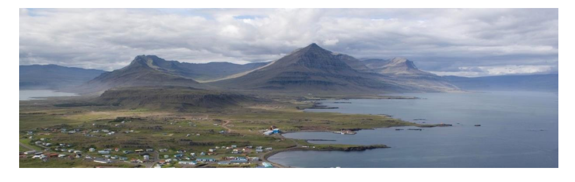
Day 5: Hofn – East Fjords – Egilsstadir

Narrow Fjords – Steep Mountains – Picturesque Coastline – Local Microbrewery Approximate Driving Distance: 260 km (162 miles)