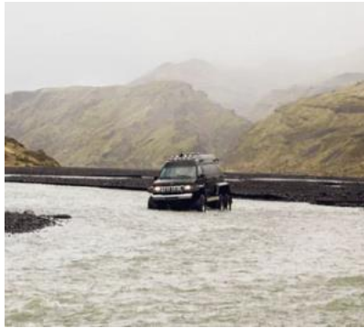
The drive into Þórsmörk