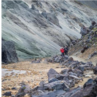
Grænagil – the green gorge