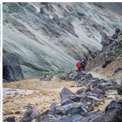
Grænagil – the green gorge