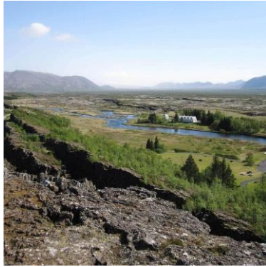
Thingvellir National Park