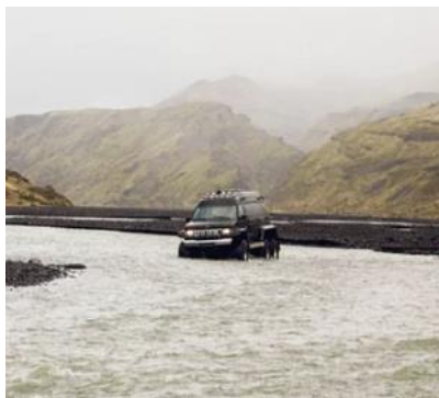
The drive into Þórsmörk