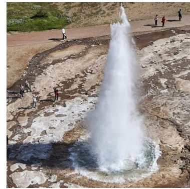
Geysir hot spring