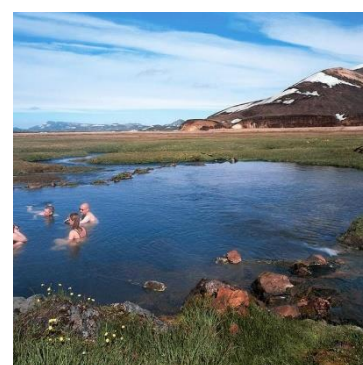
Bathing in the geothermal water