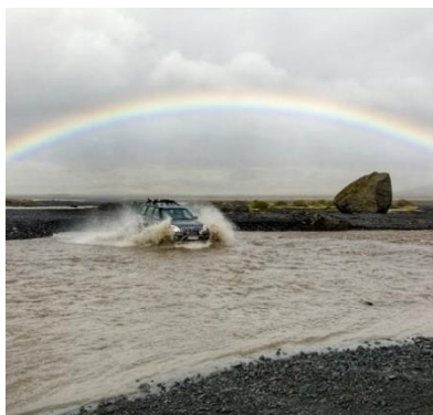
On the way to Þorsmörk