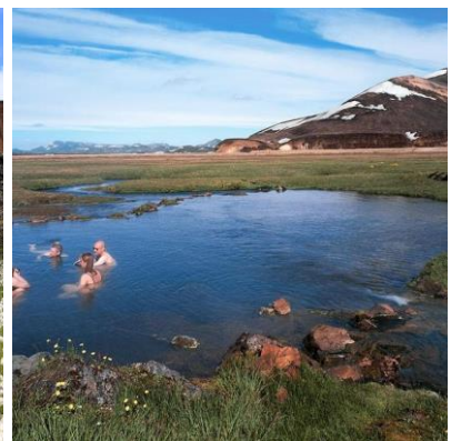
Bathing in the geothermal water