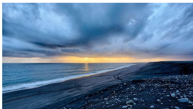
The black sand beach Skogarasandur

After lunch, the tour takes you for a fun action drive to the black volcano beaches of the south, where you have panoramic views in all directions with the Atlantic Ocean beating the shore on one side and glaciers and volcanos on the other. Our last stop of the day is one of the largest waterfalls in Iceland, the impressive Skógafoss. It brings water from the 2 glaciers surrounding it, Eyjafjallajökull and Mýrdalsjökull. Due to the amount of spray rainbows are usually visible on sunny days but the spray means you're likely to get wet if you get up close. But you should definitely take the extra steps as it's quite empowering standing close to it.