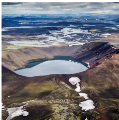
Hnauapollur crater lake