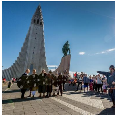
Hallgrímskirkja church in Reykjavik & harbour