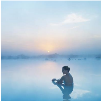
The Blue lagoon

After an amazing day, return to the hotel for dinner and overnight.