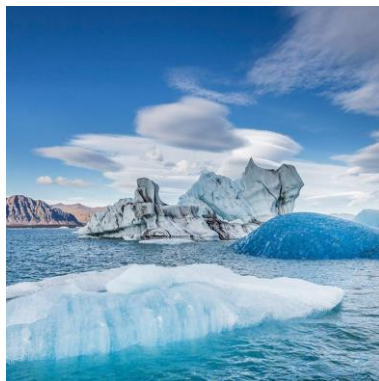
Glacier lagoon Jökulsárlón

Dinner and overnight stay in the Kirkjubaejarklaustur area.