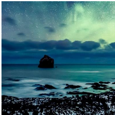
The Northern Lights

Pick-up from hotel for an Airport Express transfer to Keflavik International Airport for your flight departure.