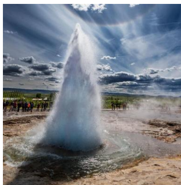
Geysir hot spring