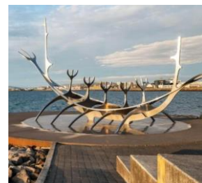
Laugardalslaug swimming pool Hallgrímskirkja church in Reykjavik, harbour & sculpture Sun Voyager