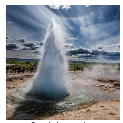
Geysir hot spring