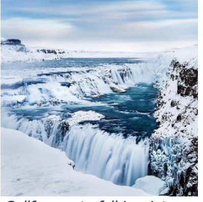
Gullfoss waterfall in winter