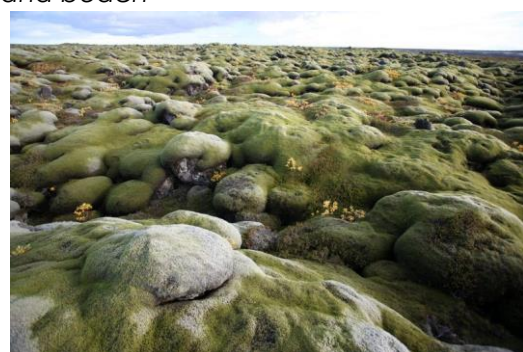
Moss covered lava field