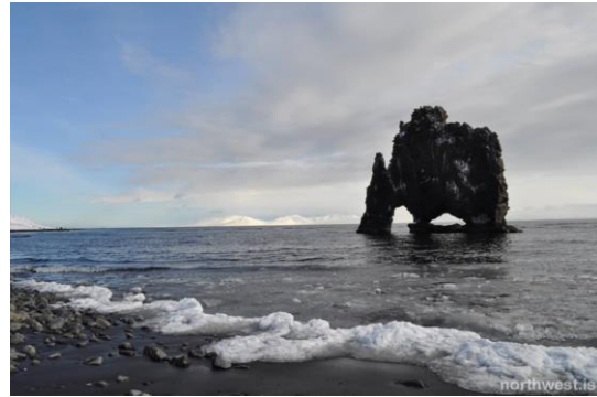
Hvítserkur rock formation