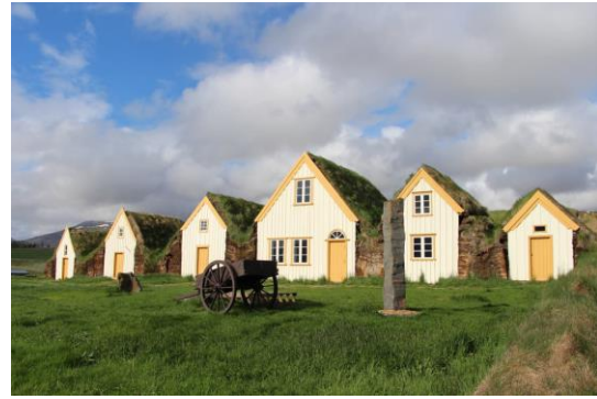
Glaumbaer turf houses

Included is a visit to the Herring Era Museum in Siglufjörður, Iceland's largest maritime museum and the only one in Iceland that won the European Museum Awards. We won't miss the opportunity to taste the herring along with Brennivín, Icelandic schnapps.