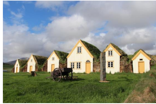
Glaumbær turf houses

Included is a visit to the Herring Era Museum in Siglufjörður, Iceland's largest maritime museum and the only one in Iceland that won the European Museum Awards. We won't miss the opportunity to taste the herring along with Brennivín, Icelandic schnapps.