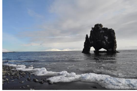
Hvítserkur rock formation