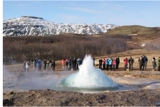
Strokkur hot spring