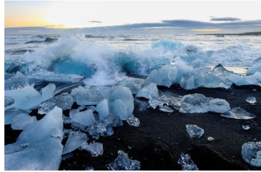
Jökulsárlón Glacier lagoon & Diamond beach

Then we visit the Lava & Volcano Exhibition Centre focused on geology and active volcanoes and watch a documentary film about volcanic eruptions in the past years in Iceland. Farewell dinner at a local restaurant in Reykjavík, Iceland's capital.