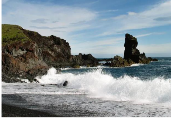
Djupalonsandur black pebble beach at Snæfellsnes