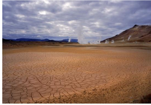
Namafjall hot springs

Petra collected for nearly 80 years this unique treasure of rocks, crystals, zeolites, quartz and more, all from the nearby area in the Eastfjords. In the afternoon we see Vatnajökull, Europe's biggest glacier that is visible all over Southeast Iceland.