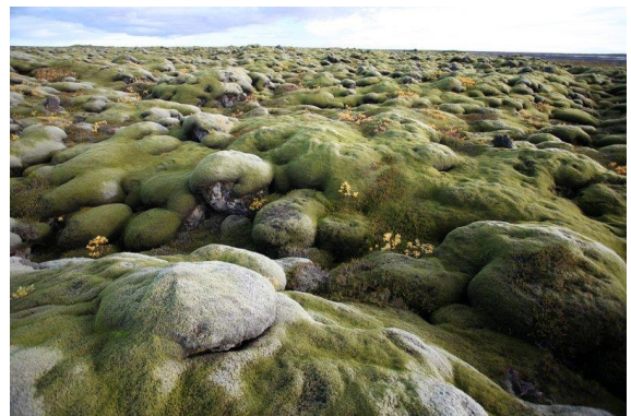
Moss covered lava field