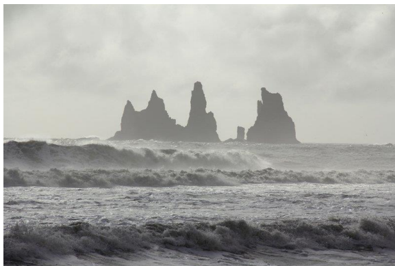
Reynisdrangar rock columns at Vik