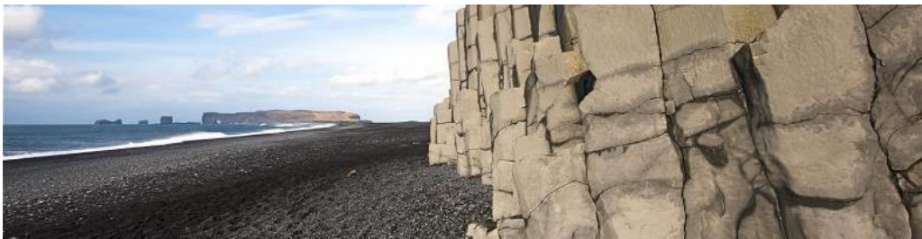
Reynisfjara black sand beach