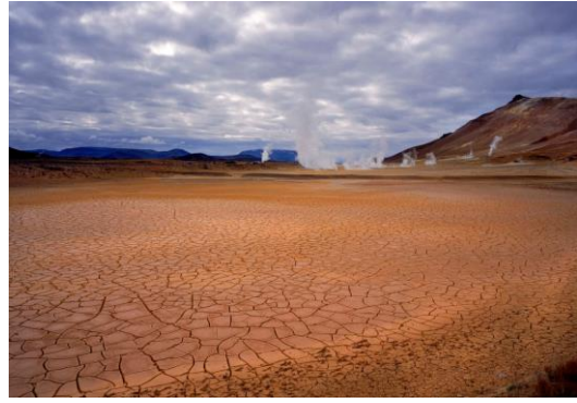
Namafjall hot springs

Petra collected for nearly 80 years this unique treasure of rocks, crystals, zeolites, quartz and more, all from the nearby area in the Eastfjords. In the afternoon we see Vatnajökull, Europe's biggest glacier that is visible all over Southeast Iceland.