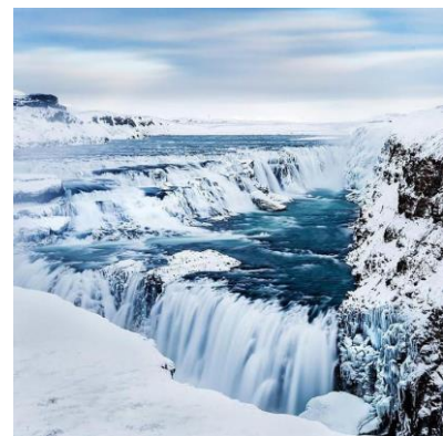
Gullfoss waterfall in winter