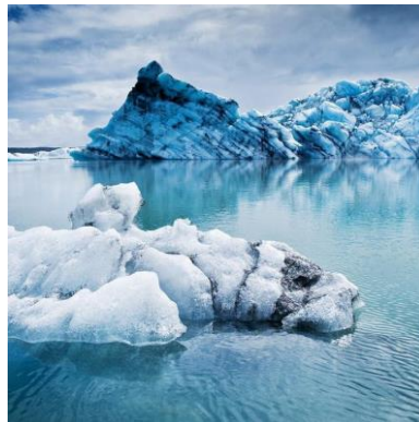
Glacier lagoon Jökulsárlón