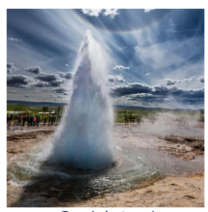
Geysir hot spring