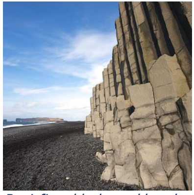
Rynisfjara black sand beach

Duration 10 hours. 08:30 pick up from Hotel, tour departs at 09:00.