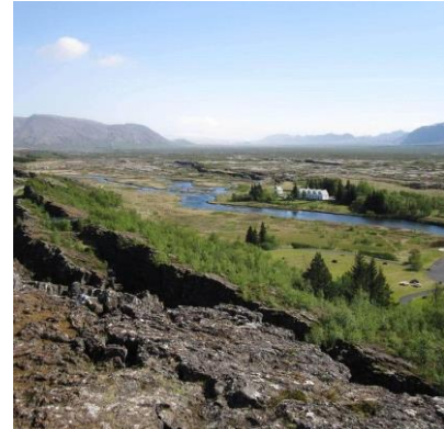
Thingvellir National Park