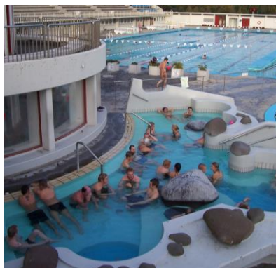
Laugardalslaug swimming pool