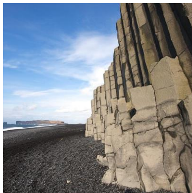
Reynisfjara black sand beach

Duration 10 hours. 08:30 pick up from Hotel, tour departs at 09:00.