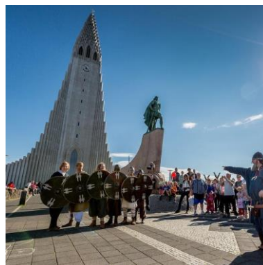
Hallgrímskirkja church in Reykjavik & harbour