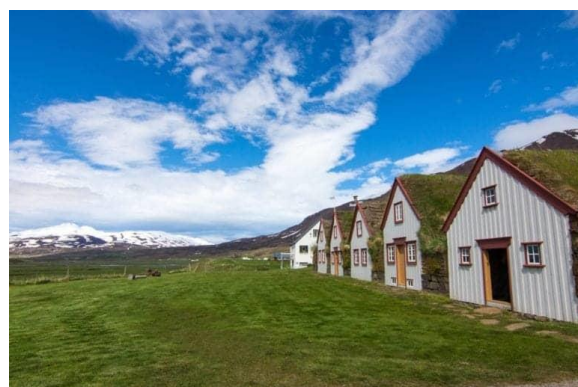
Glaumbær turf houses