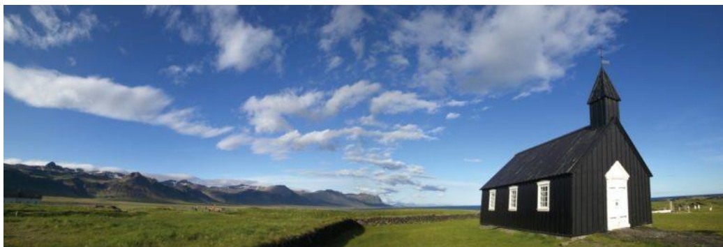
Buðir church on Snæfellsnes peninsula

Overnight in Reykjavik. Dinner is on your own.