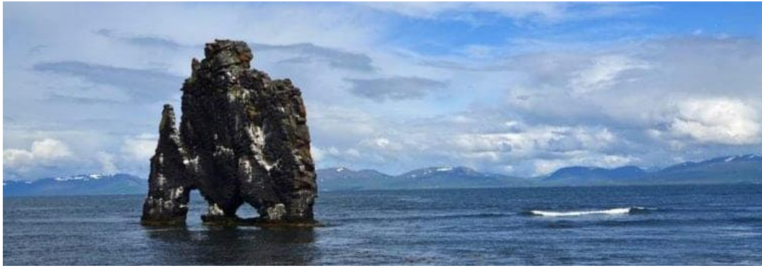
Hvitserkur rock formation