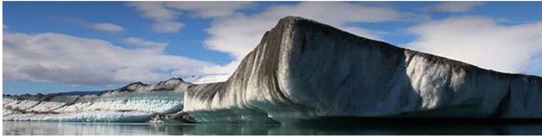
Jökulsárlón Glacier lagoon