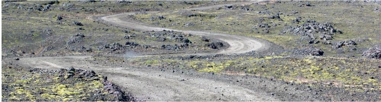
Sprengisandur highland road

Dinner and overnight stay in the Thjorsardalur area.