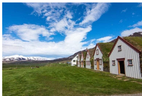
Glaumbær turf houses