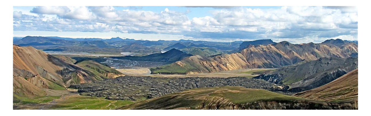
Small-Group Sightseeing and Easy Nature Hikes

Experience the otherworldly volcanic landscapes of Iceland's uninhabited interior. With a specially 4×4 mountain coach, travel off the beaten track through the untamed highlands of Iceland, highlighted by the multi-coloured mountains of the Landmannalaugar Nature Reserve and the barren black sands of Sprengisandur. When combined with other major attractions such as the Geysir geothermal area, Jokulsarlon Glacier Lagoon, and Dettifoss waterfall, this tour is sure to conquer the hearts of all first-time visitors, as well as those who have been here before.