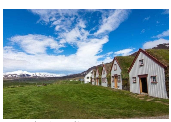
Glaumbær turf houses