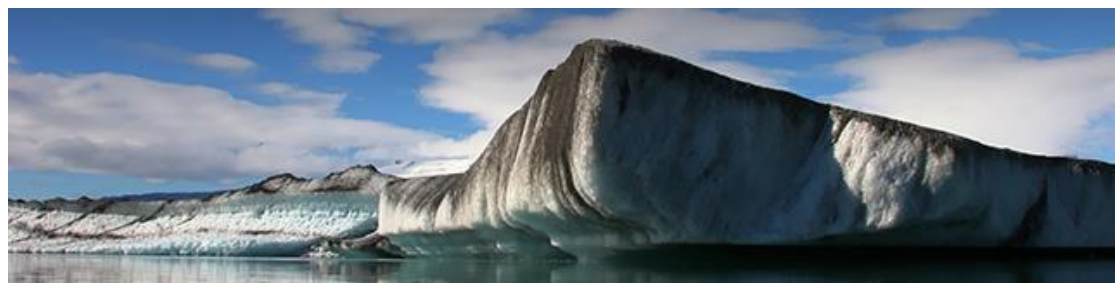
Jökulsárlón Glacier lagoon

Dinner and overnight stay in Kirkjubaejarklaustur area for the next two nights.