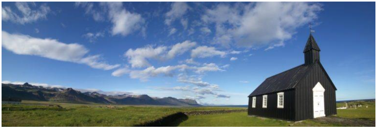
Buðir church on Snæfellsnes peninsula

Overnight in Reykjavik (if included in the package, otherwise on your own) . Dinner is on your own.