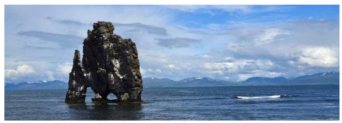
Hvitserkur rock formation

Dinner and overnight stay in the Laugarbakki area.