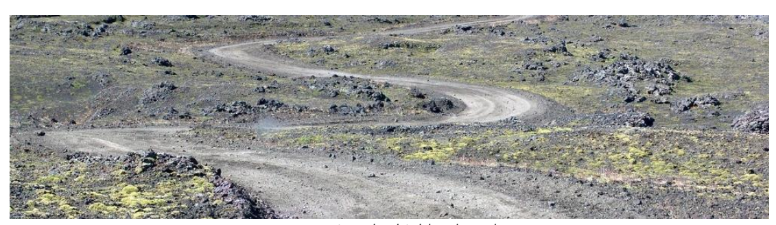
Sprengisandur highland road

Dinner and overnight stay in the Thjorsardalur area.