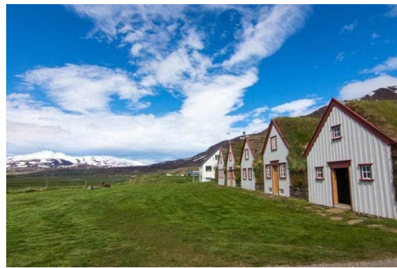
Glaumbær turf houses