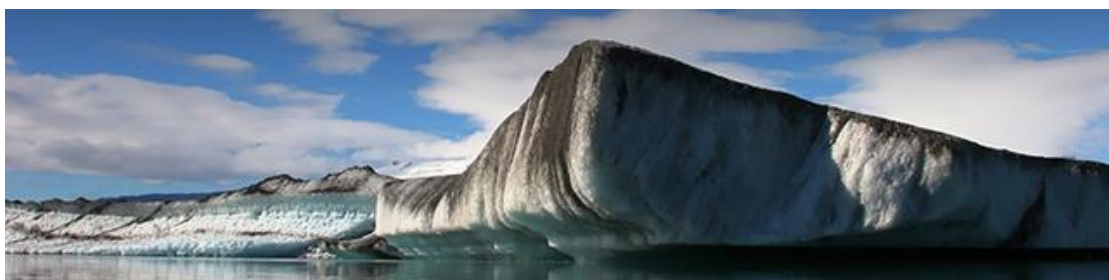
Jökulsárlón Glacier lagoon

Dinner and overnight stay in Kirkjubæjarklaustur area for the next two nights.