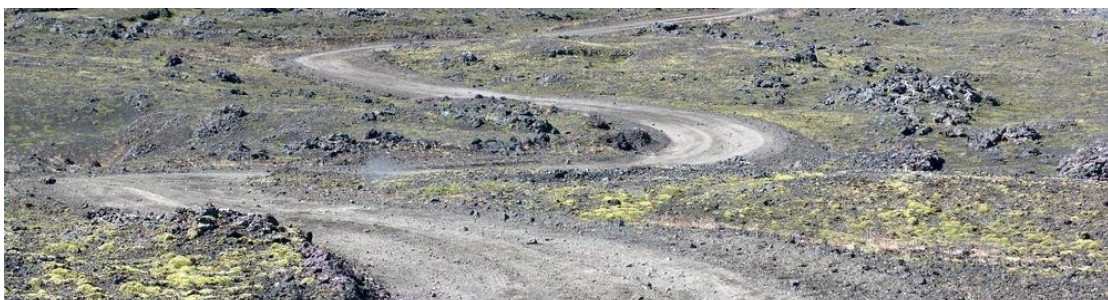
Sprensisandur highland road

Dinner and overnight stay in the Thjorsardalur area.