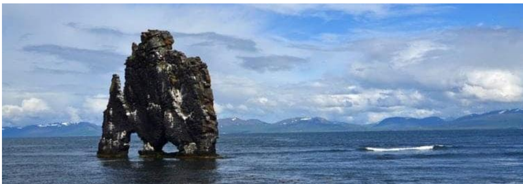
Hvitserkur rock formation

Dinner and overnight stay in the Laugarbakki area.