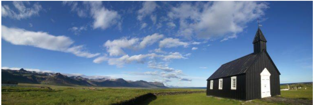
Buðir church on Snæfellsnes peninsula

Overnight in Reykjavik (if included in the package, otherwise on your own) . Dinner is on your own.